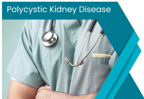
Polycystic Kidney Disease

Polycystic Kidney Disease is an inherited disorder in which clusters of cysts develop primarily within your kidneys causing your kidneys to enlarge and lose function over time.